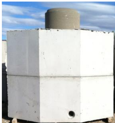
Medium Well Pit

BOOM CONCRETE will deliver to your site and set the tank in the prepared location.