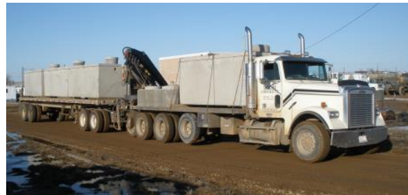
Truck and trailer loaded with tanks ready for delivery