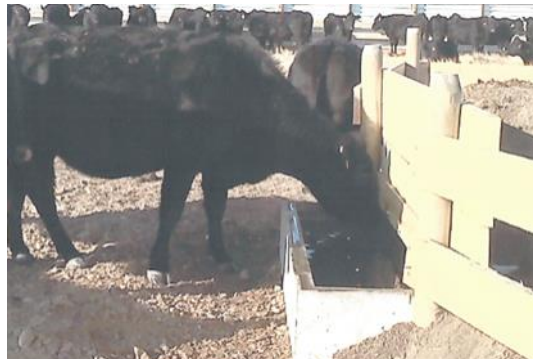
Winter Stock Tank ( Partially buried )