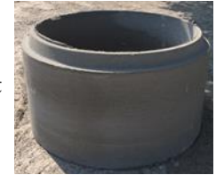
30" Tile for Float