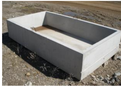
1000 Gallon Stock Tank Without Hole