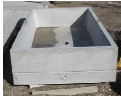
1000 Gallon Stock Tank With Hole