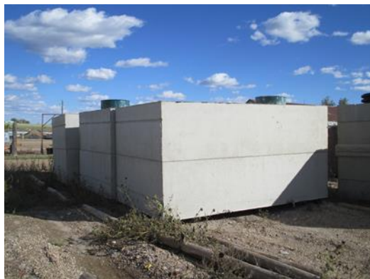
Combine cisterns for needed storage capacity.

BOOM CONCRETE CISTERN tanks are designed and built with high quality components including specially formulated concrete, steel rebar, and concrete fiber, which is embedded throughout the tank.