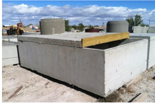
1400 Gallon Winter Stock Tank